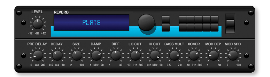
PLATE REVERB emulates the characteristics of a plate reverb chamber with control over the damping pad, modulation depth and speed, and crossover. PLATE REVERB will give your tracks the sound heard on countless hit records since the late 1950's. (Inspired by Lexicon PCM70*)

Digital Rack Mixer for Installed and Live Sound Applications with 40 Input Channels and 25 Mix Buses